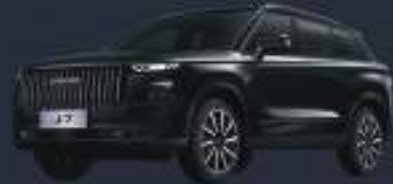
Carbon Crystal Black