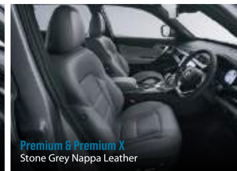
Premium & Premium X Stone Grey Nappa Leather