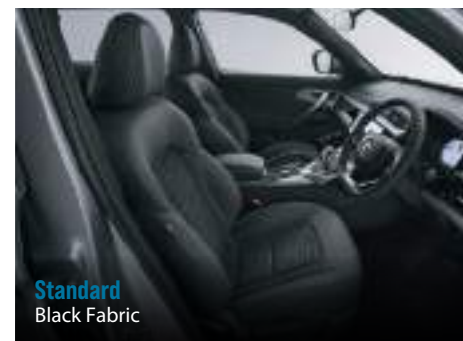
Standard Black Fabric